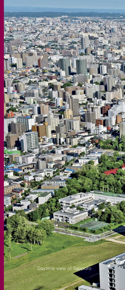
Daytime view of Sapporo