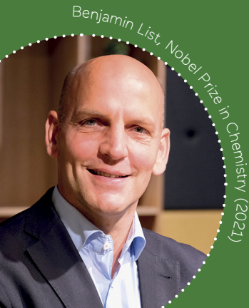
Benjamin List, Nobel Prize in Chemistry (2021)