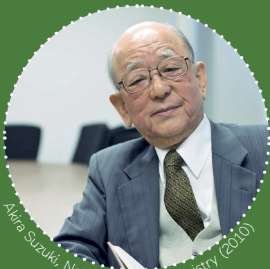
Akira Suzuki, Nobel Prize in Chemistry (2010)